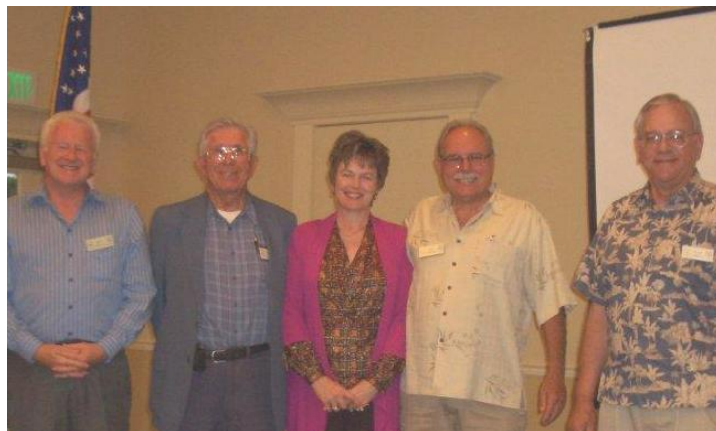
Our Board of Directors—But A Few were not Available