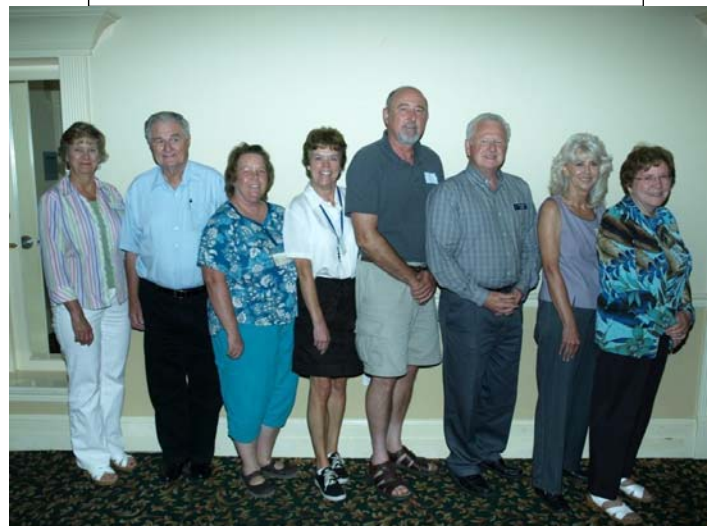
Officers and Board Members Present and Sworn in at the July 2009 Meeting

Be sure to visit our website for details on upcoming events and news of our Chapter