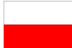
Poland Liberation Day July 22