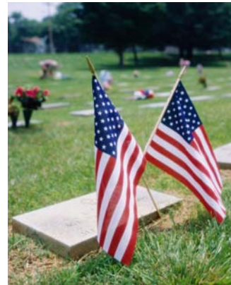
Memorial Day May 30

Be sure to visit our website for details on upcoming events and news of our Chapter