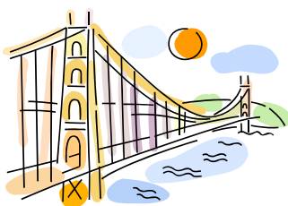
San Francisco Earthquake April 18 1906